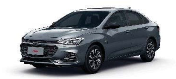
Black Graphite Metallic