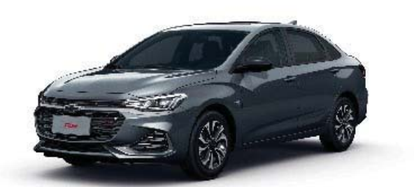
Satin Steel Metallic