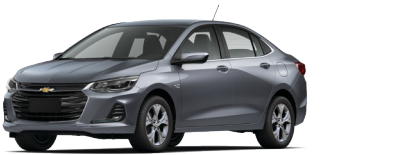
Satin Steel Metallic