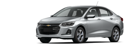
Silver Ice Metallic