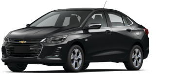
Black Graphite Metallic

General Motors de Mexico, S. de R.L. de C.V. (“GMM”) located at Av. Ejercito Nacional #843-B, Col. Granada, C.P. 11520, Mexico City, United Mexican States, keeps updated its manufacturing techniques in a continuous improvement process, therefore GMM reserves the right to update the information displayed in this brochure at any time, without prior notice. Vehicles are subject to availability, of the models, fuel efficiency, colors, features and characteristics, equipment, appearance and/or accessories (the “Specifications”). The Specifications and vehicles shown in this brochure depend on their availability for each country where the purchase is done. Some of the pictures in this brochure are displayed for illustrative purposes and may include vehicles with original accessories not included or not available at the time of the purchase. Prior to the purchase and delivery of the vehicle, please verify the Specifications with your Authorized Chevrolet Dealer. GMM reserves the right to continue or