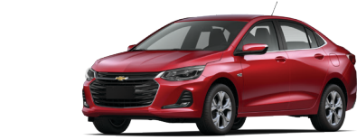
Cajun Red Metallic